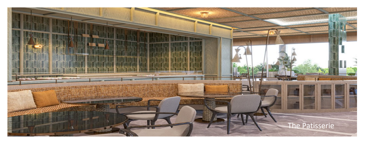
NEWLY Located on the top floor of Gloria Serenity you will find The Patisserie, a Chocolatier and a Ice Cream Bar.

Various other bars can be found around the resort – Traces Beach Bar, Dock's Pier Bar, Wurlitzer Karaoke Bar, Route 66, Insomnia Disco Bar.