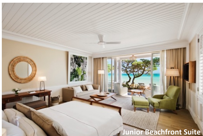
Junior Beachfront Suite

The distinguished, exclusive, and luxurious Ocean Suites offer breathtaking views of the lagoon, with your own lounge, terrace, garden, private beach and outdoor shower. (The space is 104m 2 )